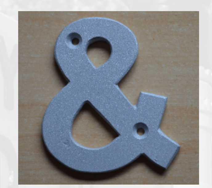
Some 'specials' can be hand made by us